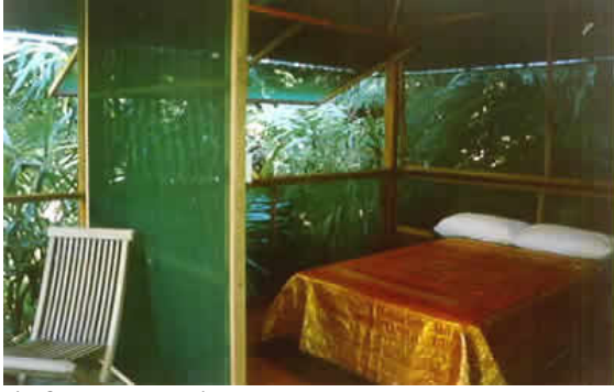
Rainforest Hut share Rainforest Hut single

$880.00 (shared bathroom facilities) $1104.00