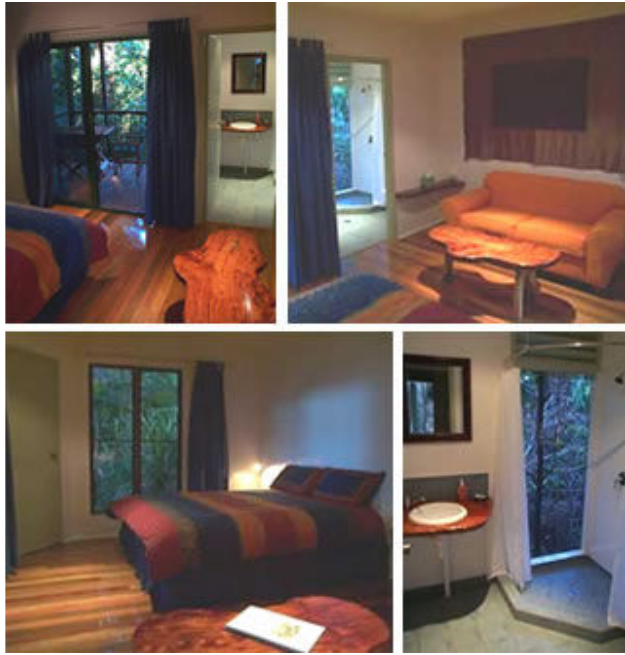
Deluxe Canopy Cabin share Deluxe Canopy Cabin single

$880.00 (shared bathroom facilities) $1104.00